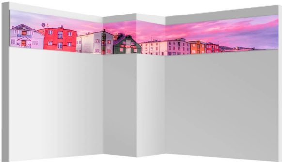
Banner & Ribbon